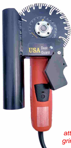
Guard shown attached to grinder, grinder not included.

Complete "Dustless" System Vac, Grinder, Dust Guard