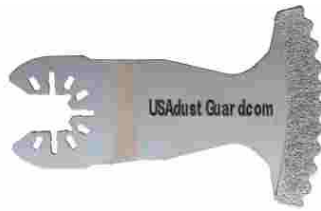
Diamond Oscillating Blade