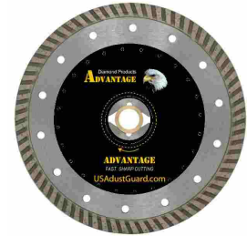
Ultra Thin / Butter Joint Blades