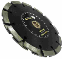
Sandwich - Black

SIGNATURE BLADE Supreme Maxx Blade assembled as a Sandwich Blade. Cuts sharp through granite & hard mortars, outlasts competitive blades 2 : 1.