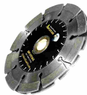
Sandwich - Silver

SIGNATURE BLADE Supreme Maxx Blade assembled as a Sandwich Blade. Cuts sharp through granite & hard mortars, outlasts competitive blades 2 : 1.