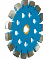
Solid - Speed Tuck