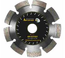
Solid - Premium