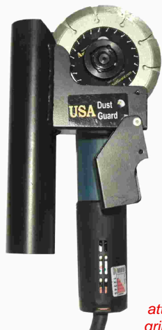
Guard shown attached to grinder, grinder not included.

Complete "Dustless" System Vac, Grinder, Dust Guard