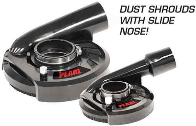
DUST SHROUDS WITH SLIDE NOSE!