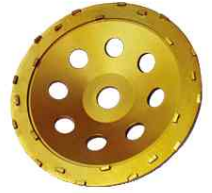
* Chip PCD