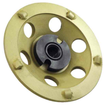
* Quarter Round PCD