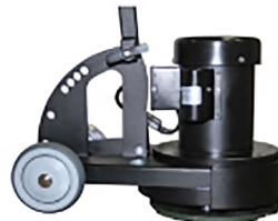
48" Handle with 6-Position Pin Lock.