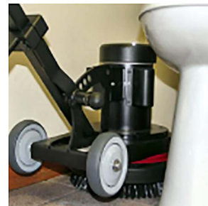
Works in tight spaces.