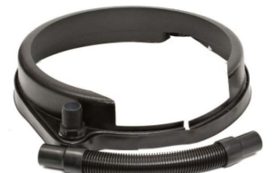
Optional Dust Skirt with 1-1/2" Vac Port.