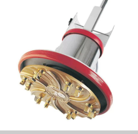
10" - 26" Concrete Grinders