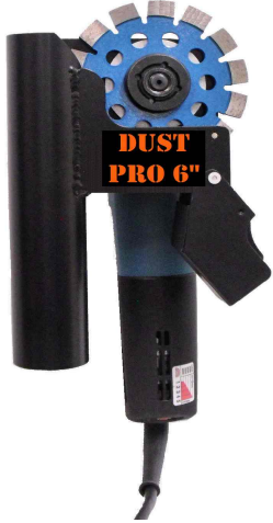
Guards are shown attached to grinders — grinders & blades not included.

Div. of Scott Electric • 412-605-2992 (Direct#)