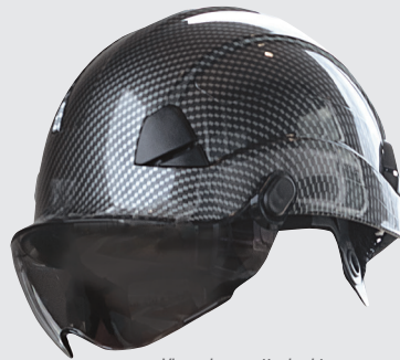
Visor shown attached to DPG22 Safety Helmet. Helmet sold separately.