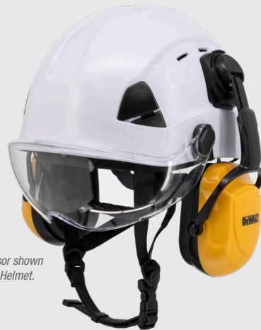
Capmount Earmuff and Visor shown attached to DPG22 Safety Helmet. Helmet sold separately.