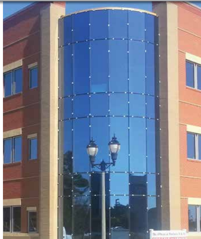
The Offices at Mayfaire NC - brick