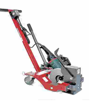
#GCT-9 Please call for price