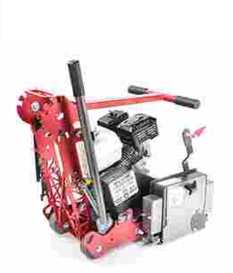
#GCT-XE Please call for price

Same price and quality as the GS-100 (left), but heavier-duty.