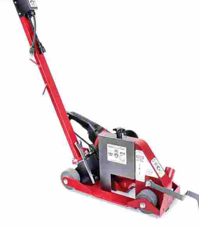
#GCT-10 Please call for price