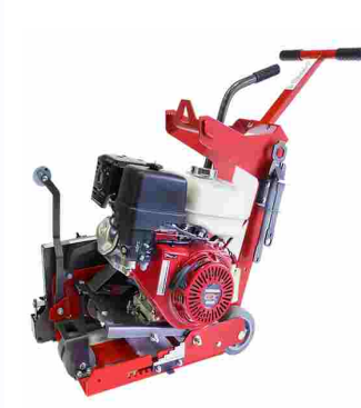
#GCT-X Please call for price