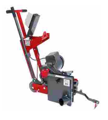
#GCT-XE Please call for price