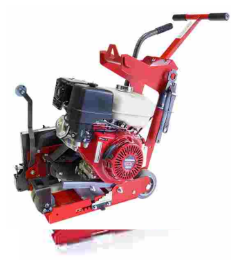
#GCT-8-II Please call for price