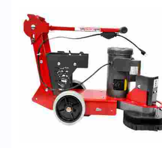
#SG-8 Please call for price