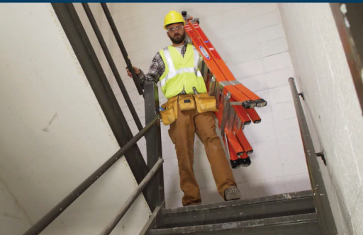
Maneuvers easily through jobsite