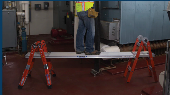
Scaffolding bases require no additional hinges* *plank and tie-downs not included