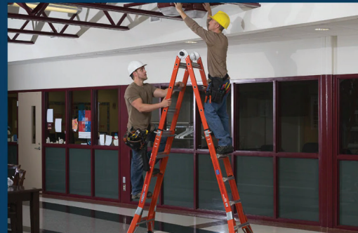
300lb load capacity per side